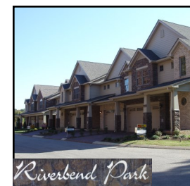
Riverbend Park Town Homes Murfreesboro, TN