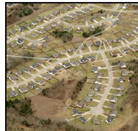
Triple Crown Mt. Juliet, TN