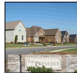
The Preserve at Puckett Station Murfreesboro, TN