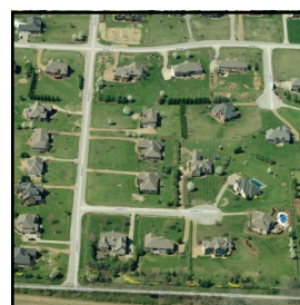
Whitehall Farms Franklin, TN